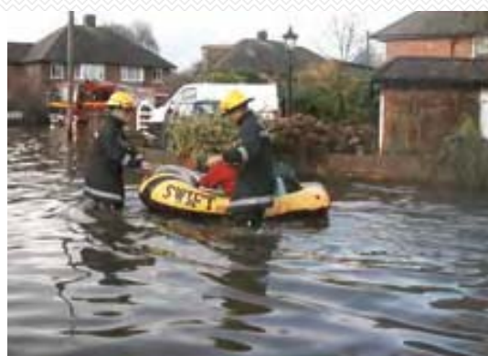
Flooding in Chertsey 2003

http://www.environment-agency.gov.uk/homeandleisure/floods/107478.aspx